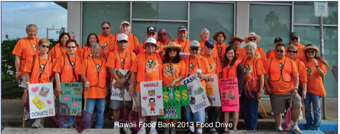
Hawaii Food Bank 2013 Food Drive