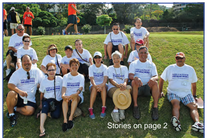
Stories on page 2