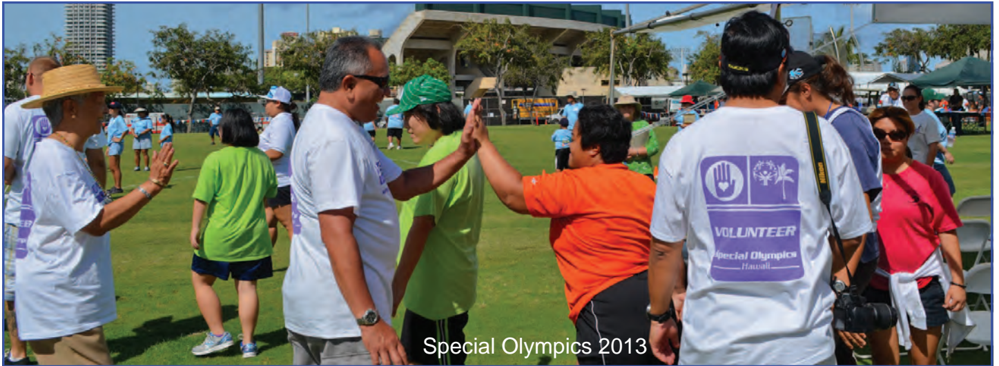
Special Olympics 2013