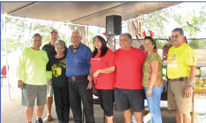
Bottom: Harmony Lodge #3 and My Father's House volunteers.