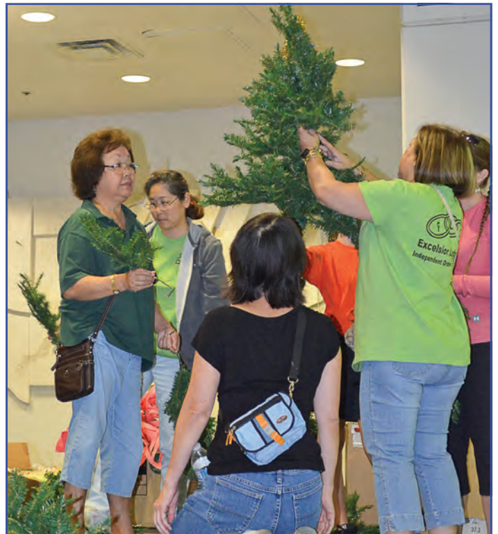
Excelsior Lodge members setting up the main stage decorations.

Where can you squeeze 1,300 children, 1,000 parents and 1,646 volunteers into one room? The NBC Exhibition Hall, that's where! This year's holiday luncheon, care of Family Programs Hawaii was again a huge success thanks in part to the 30+ Excelsior Lodge volunteers that showed up at 6:00 AM to spread their Aloha! Our members were able to transform the entire Exhibition Hall from a stark and lifeless hall into a Christmas wonderland with Christmas decorations and trimmings. Our brothers and sisters worked to put up banners, set-up tables and chairs, set-up vendor booths, donned Christmas Trees and where ever help was needed. Our group won the hearts of many of the other volunteers for our willingness and enthusiasm...to all of you, MAHALO! I urge all of you to consider coming out next year to kokua, it will warm your heart to know that your hard work made a difference in the life of a child.