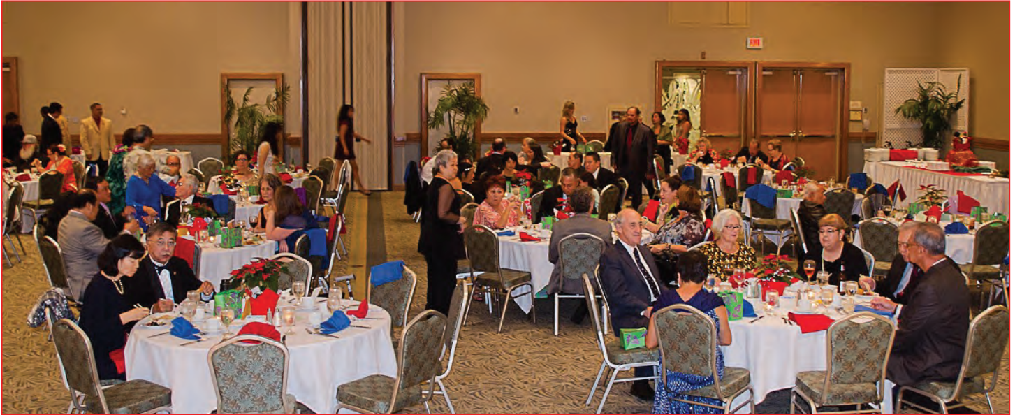
Excelsior Lodge #1 celebrated their 164 th anniversary on Saturday, December 5, 2015. Held at the Ala Moana Hotel, the event was well attended by the more than 125 members and guests in attendance. Chartered on December 10, 1846, Excelsior Lodge is the oldest Odd Fellows lodge west of the Rockies.