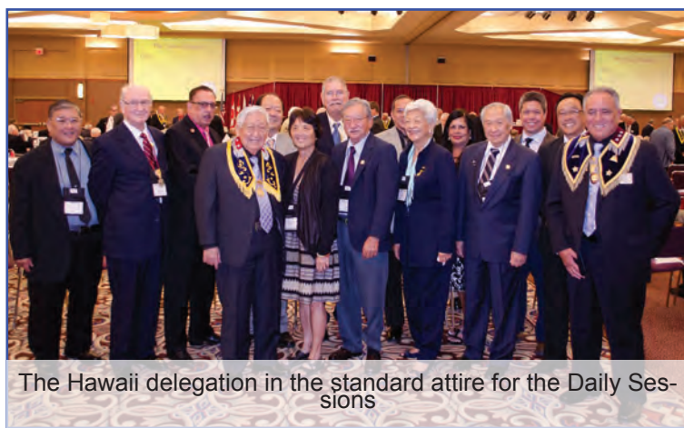
The Hawaii delegation in the standard attire for the Daily Sessions