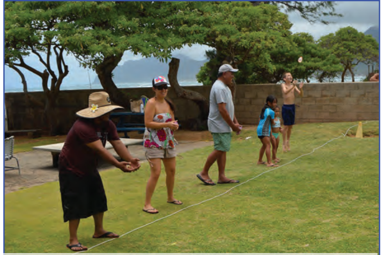
Fun & Games