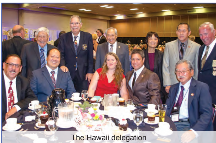
The Hawaii delegation