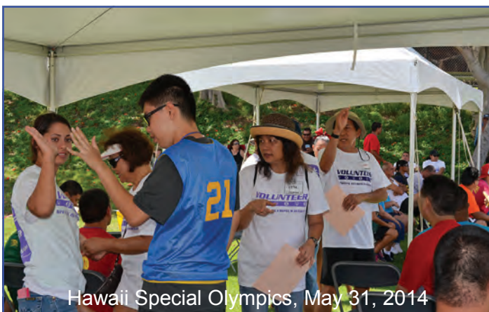
Hawaii Special Olympics, May 31, 2014