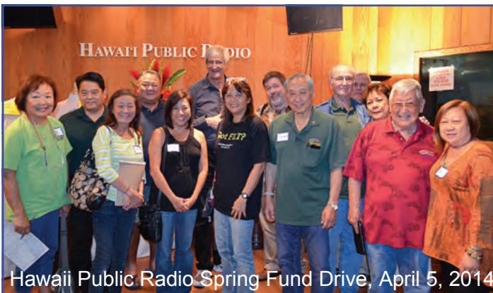
Hawaii Public Radio Spring Fund Drive, April 5, 2014