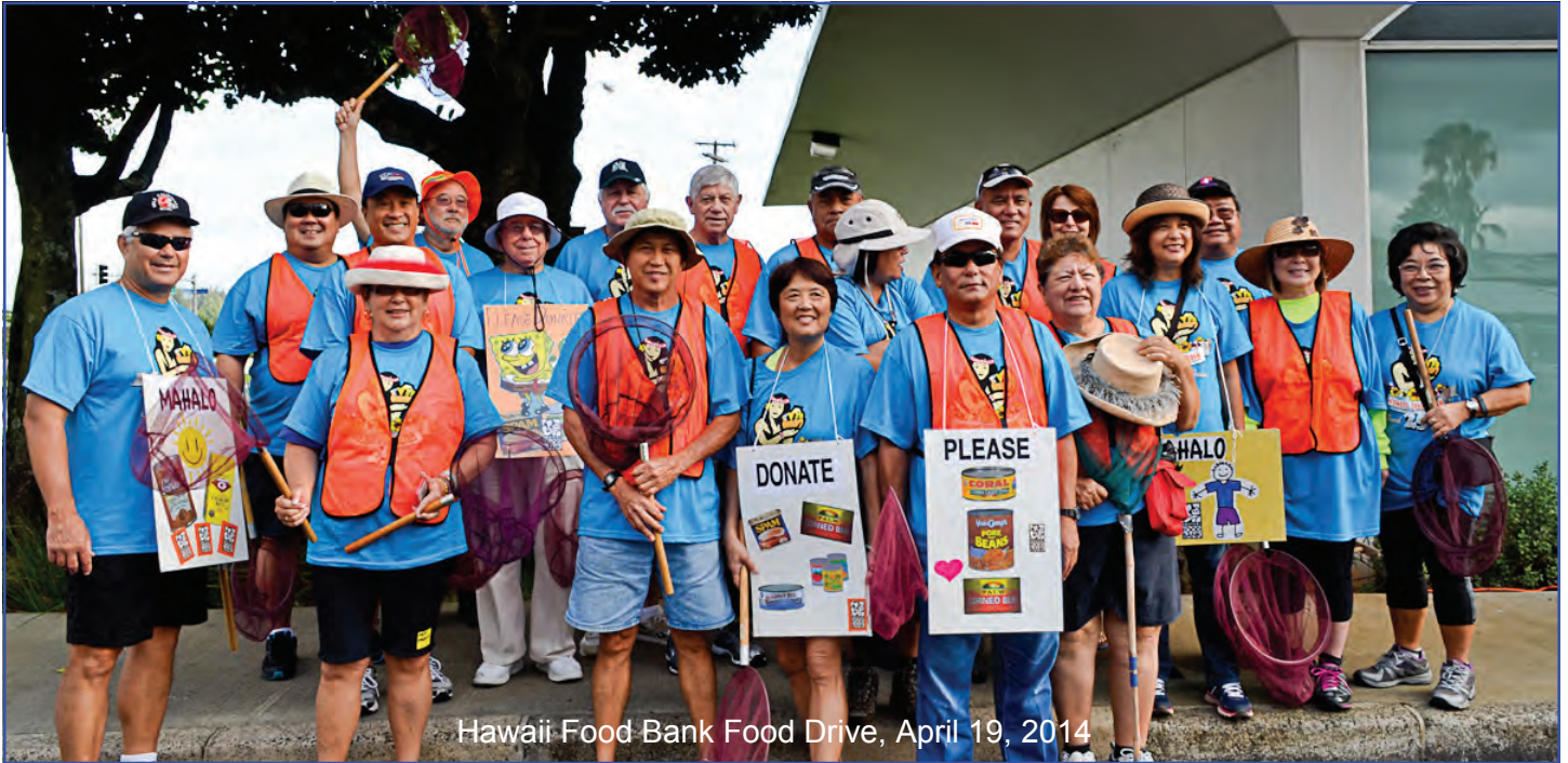
Hawaii Food Bank Food Drive, April 19, 2014