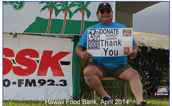
Hawaii Food Bank, April 2014