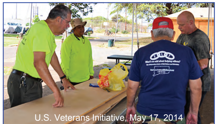
U.S. Veterans Initiative, May 17, 2014