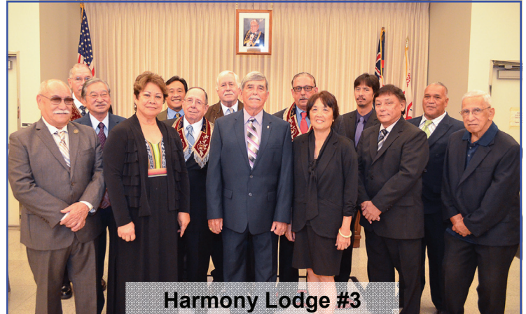
Harmony Lodge #3