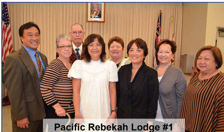
Pacific Rebekah Lodge #1