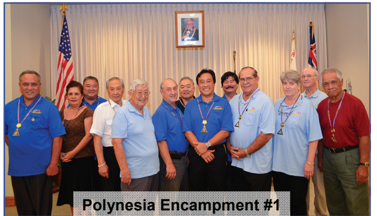
Polynesia Encampment #1