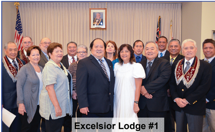
Excelsior Lodge #1

Odd Fellow lodges, Excelsior #1, Harmony #3, along with Pacific Rebekah Lodge #1 installed their elected and appointed officers for 2014 on Tuesday, January 21, 2014. The joint installation was held at the Kapahulu Lodge Hall and was well attended by Hawaii Odd Fellow members. The officers for the Polynesia Encampment #1 and Kamehameha Canton #1 were installed the night of February 5, 2014 also at the Kapahulu Lodge Hall. We wish the best for these officers and hope all members fully support their efforts in the coming year.