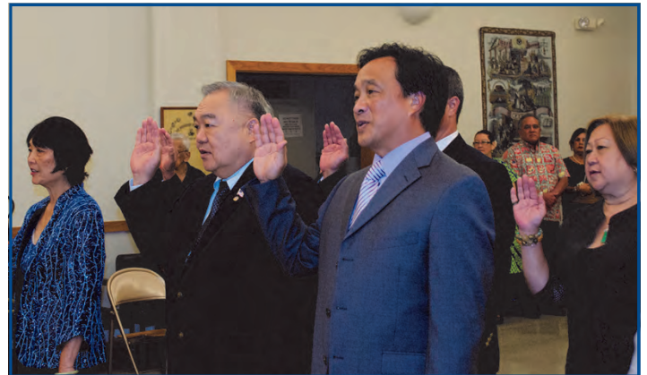
Taking the oath of office