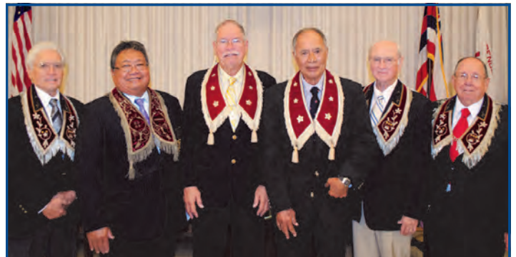
The Installing officers for the 2015 installation.