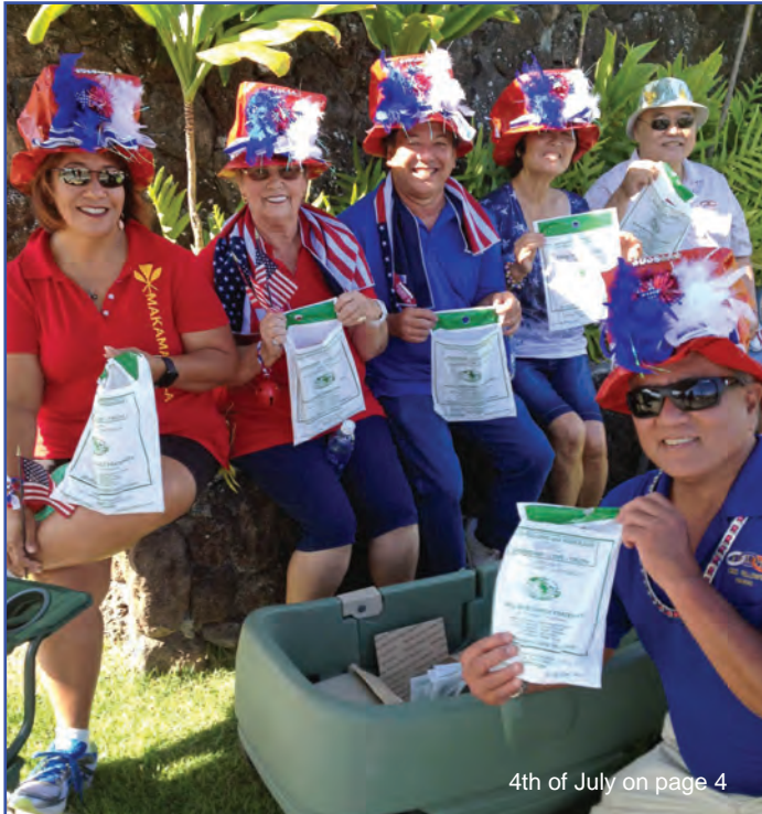
4th of July on page 4