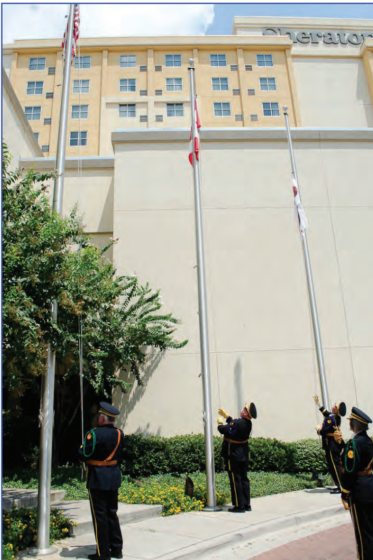
The Flag Raising Ceremony on Sunday formally opens the Sessions.