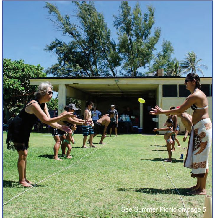
See Summer Picnic on page 5