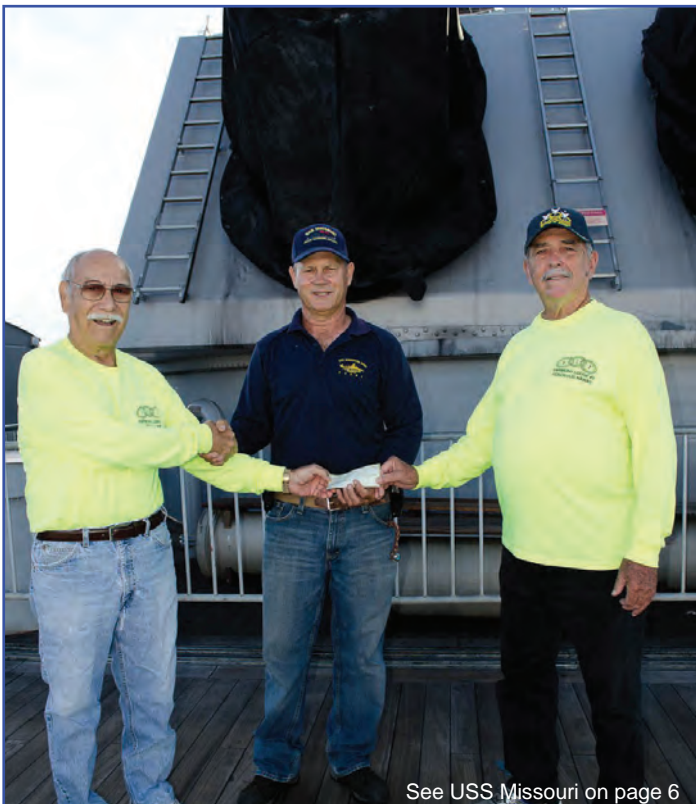
See USS Missouri on page 6