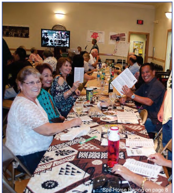
See Horse Racing on page 8