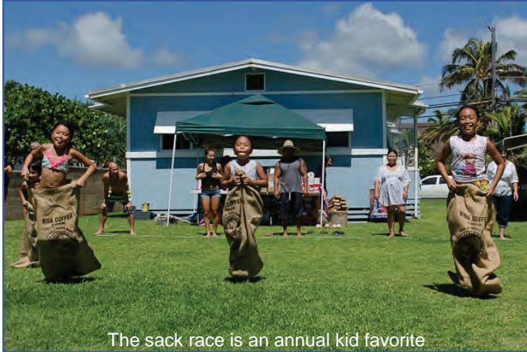
The sack race is an annual kid favorite

Excelsior Lodge #1 held its annual summer picnic on Saturday, July 25, 2015. As in years past, all the Hawaii Lodges were welcome to attend and our sister lodges fully participated in the preparations for making the picnic the success it was. With over one hundred members, families and friends scheduled to attend, there was a lot of planning to be made for the food, games, music and prizes for the participants. Mahalo to all those who helped and we hope to see you in attendance again next year!