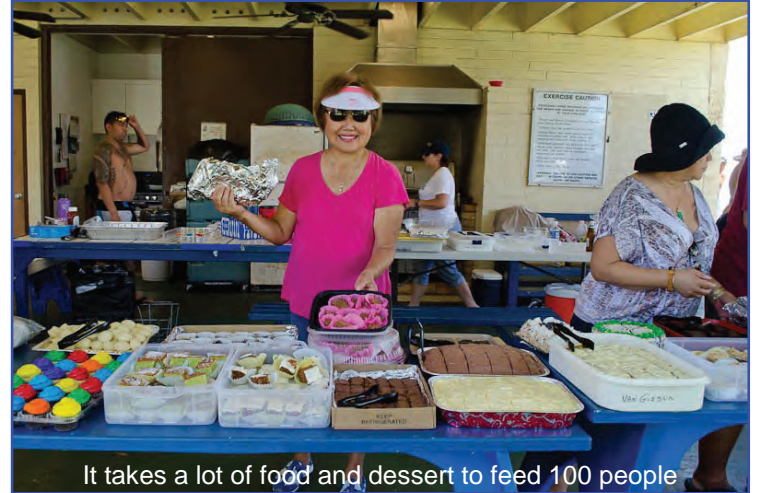
It takes a lot of food and dessert to feed 100 people