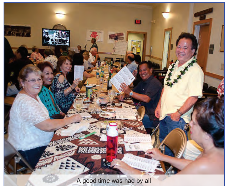
A good time was had by all